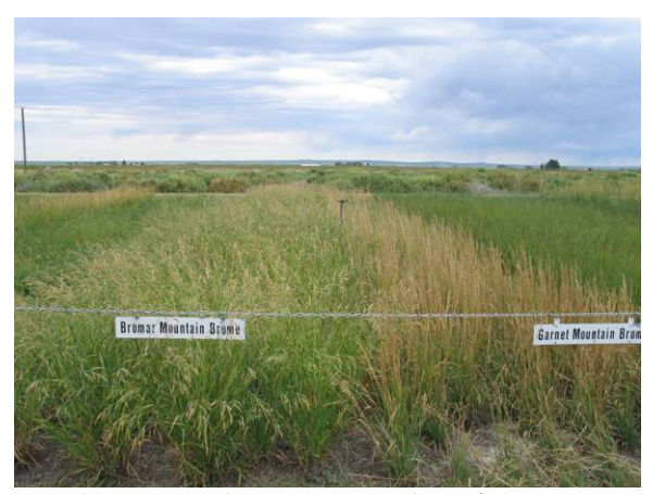
Aberdeen PMC Display nursery plots of Bromar (left) and Garnet (right).

'Bromar' was chosen from among 154 accessions collected in the Pacific Northwest and was released in 1946 cooperatively by Washington, Idaho and Oregon Agricultural Experiment Stations at Pullman, Moscow and Corvallis. It was selected for being taller, leafier and having better seedling vigor than commercial strains. It shows outstanding performance when planted in mixtures with sweetclover or red clover for short pasture rotations. Tests have shown Bromar to be moderately resistant to head smut, but chemical seed treatment is recommended. Breeder seed is maintained by the NRCS Plant Materials Center in Pullman, Washington and Foundation seed is produced by the Washington Crop Improvement Association.