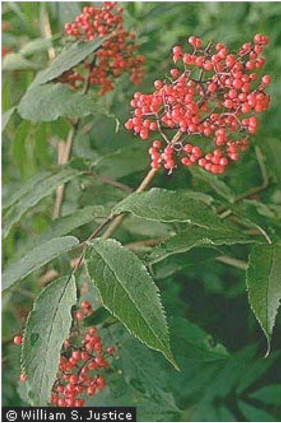
©William S. Justice. Courtesy of <u>Smithsonian Institution</u>, <u>Dept. of Systematic Biology</u>, <u>Botany</u>.

Contributed by: USDA NRCS Plant Materials Center, Corvallis, Oregon