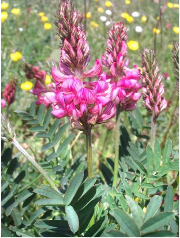
Figure 1. Mature sainfoin in flower.