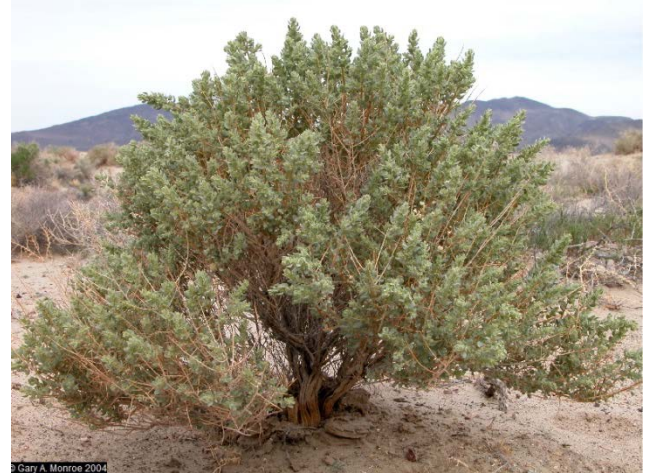
Shadscale saltbush.