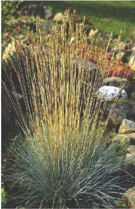
Figure 1. Sheep fescue in xeriscape garden.