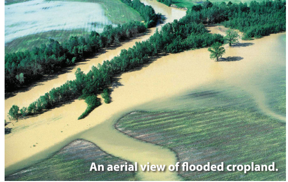
An aerial view of flooded cropland.

USDA agencies provide producers with assistance ranging from data and reports, which serve as early flood warnings, to crop insurance opportunities for damaged or lost crops to other recovery needs following floods.