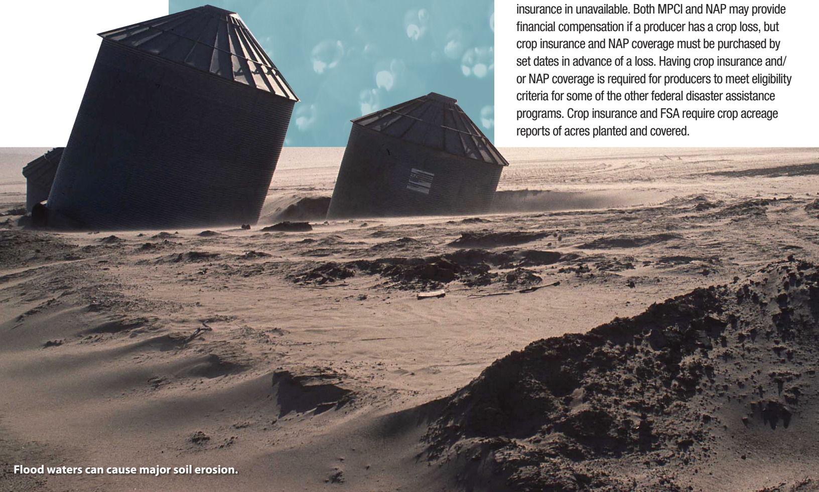
Flood waters can cause major soil erosion.

The Risk Management Agency (RMA) operates and manages the Federal Crop Insurance Program. Private-sector insurance companies sell and service the Federal Crop Insurance policies. Multi-Peril Crop Insurance (MPCI) is a federally subsidized program, assisting farm producers with the payment of their crop insurance premium costs and covers more than just floods. The Farm Service Agency (FSA) administers the Non-insured Crop Disaster Assistance Program (NAP) that covers crops for which insurance is unavailable. Both MPCI and NAP may provide financial compensation if a producer has a crop loss, but crop insurance and NAP coverage must be purchased by set dates in advance of a loss. Having crop insurance and/or NAP coverage is required for producers to meet eligibility criteria for some of the other federal disaster assistance programs. Crop insurance and FSA require crop acreage reports of acres planted and covered.