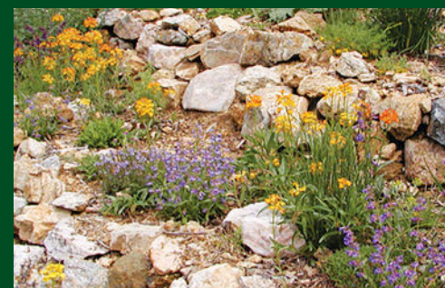
Wallflowers and Blue Mist Penstemons