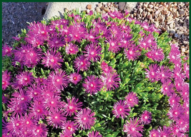
Purple Ice Plant