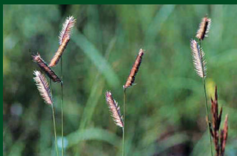
Blue Grama Grass