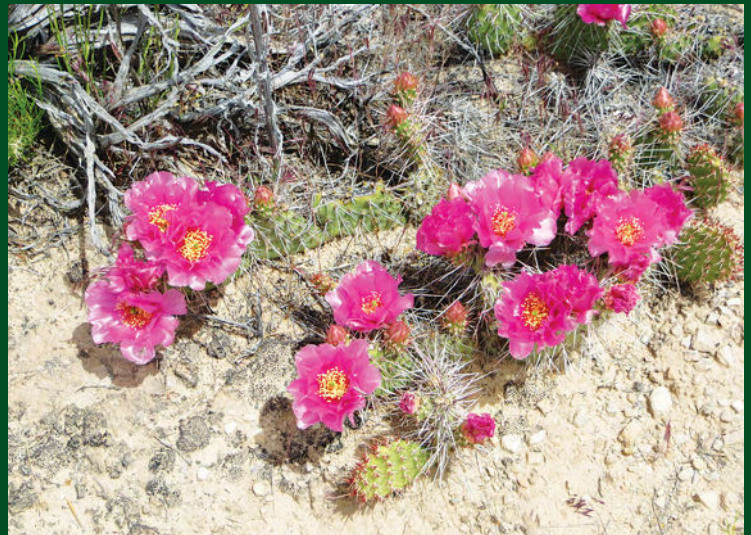
Opuntia

Colorado State University Extension is an equal opportunity provider. | Colorado State University Extension es un proveedor que ofrece igualdad de oportunidades.