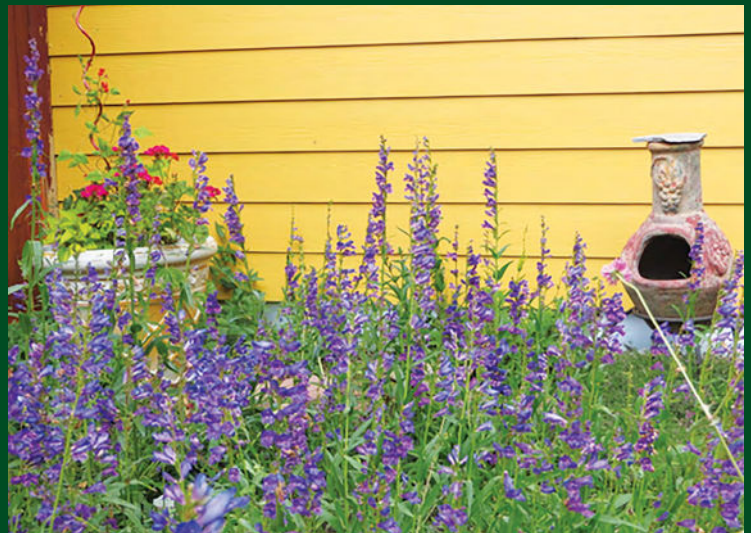
Rocky Mountain Penstemon