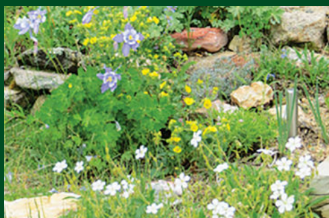
Geranium and Rocky Mountain Columbine