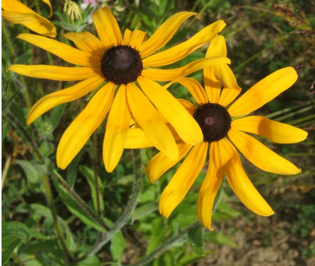
Close-up of 'Golden Jubilee' black-eyed susan in full bloom. Photo taken at the USDA NRCS Big Flats Plant Materials Center.

A Conservation Plant Release by USDA NRCS Big Flats Plant Materials Center, Corning, New York