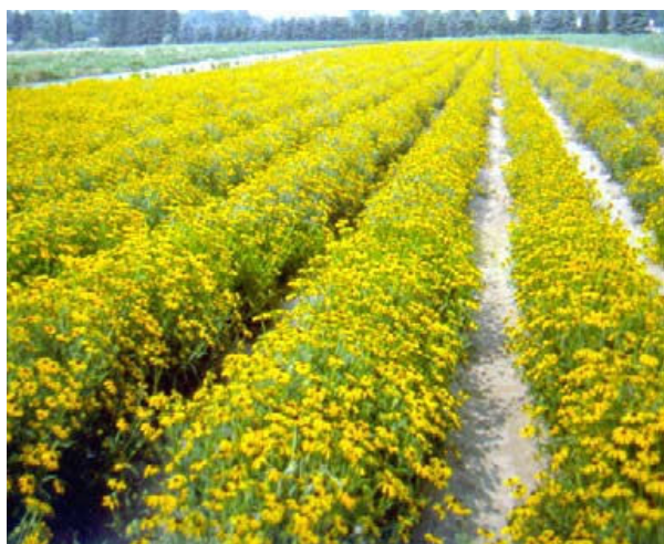
Seed production field of 'Golden Jubilee' black-eyed susan at the USDA NRCS Big Flats Plant Materials Center.

For Golden Jubilee, the recommended fertilization is 300 pounds of a 10-10-10 fertilizer per acre or 7 pounds of a 10-10-10 fertilizer per 1,000 square feet. Fertilizer can be applied as a pre-plant treatment or side-dressed during the middle of the first growing season. Periodic fertilization may be required to maintain stand vigor and appearance.